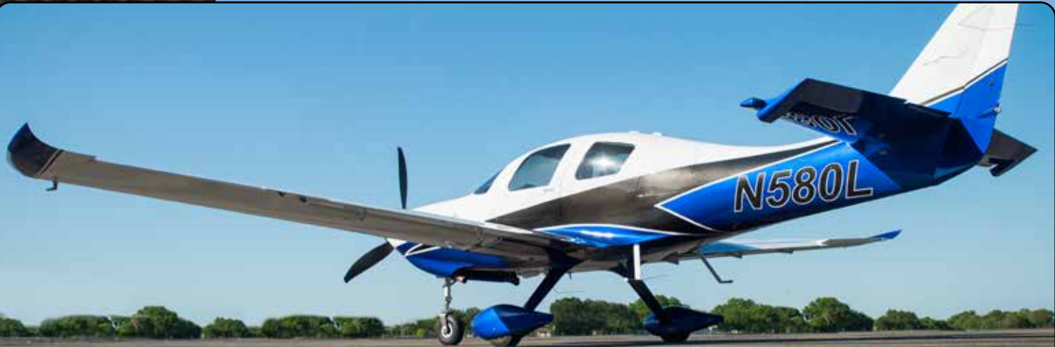
2017 Lancair Turbo Mako / SN: NLA-450-1001 • N580L