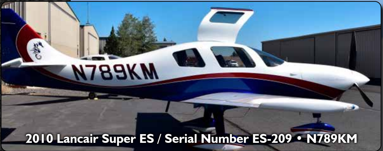
2010 Lancair Super ES / Serial Number ES-209 • N789KM