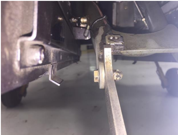
Figure 1 Original Design Lower Drag Links