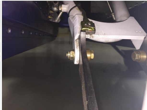
Figure 2 Improved Design Lower Drag Links

WARNING: When performing this inspection and drag link replacement, ensure that the nose of the aircraft is properly lifted, secured and shored to prevent the nose of the aircraft from collapsing to the ground which can cause damage, injury or even death. An engine hoist secured to the lifting ring on the engine is best for lifting the nose wheel off the ground.